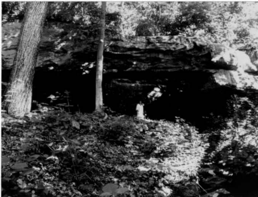
Figure 2 - Joanne Horowitz in front of Lookout Mountain Natural Bridge. Note the conformance of erosional sculpting.